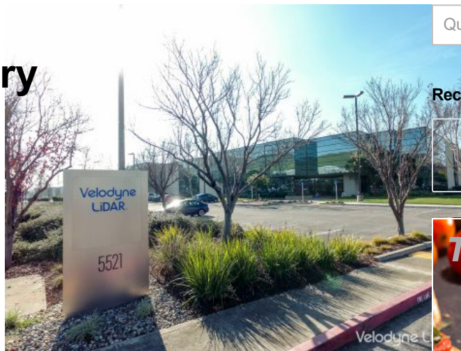
Velodyne LiDAR San Jose Mega Factory Multimedia Gallery URL