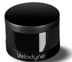
Velodyne's new Solid-State Hybrid Ultra Puck Auto

Velodyne's new Solid-State Hybrid Ultra Puck™ Auto is designed to combine the functionality of its pioneering 3D LiDAR sensors in a miniaturized form factor while extending sensing range to 200 meters. Velodyne set target pricing of less than $500 per unit in automotive mass production quantities. The Solid-State Hybrid Ultra Puck Auto will be the first affordable ADAS sensor capable of supporting ADAS levels 1-4/5, including fully autonomous driving.