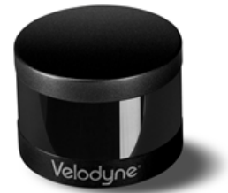
The ULTRA Puck™ VLP-32A, from Velodyne LiDAR

The ULTRA Puck VLP-32A is the company's most advanced LiDAR sensor to date, delivering high performance at a cost-effective price point. In keeping with Velodyne’s patented 360° surround view, the ULTRA Puck is able to see all things all the time to provide real-time 3D data to enable autonomous vehicles. What separates the ULTRA Puck from its predecessors and other LiDAR sensors on the market is a design created expressly for the exacting requirements of the automotive industry. The ULTRA Puck features innovative breakthroughs such as a range up to 200 meters and support for 32 LiDAR channels, providing enhanced resolution to easily identify objects. The 32 channels in the ULTRA Puck are deployed over a vertical field of view of 28° and are configured in a unique pattern to provide improved resolution in the horizon.